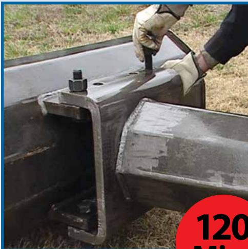
Traditional Bolted Connection

NEETRAC tests confirm QUICKPIN™ connections perform identically to bolted connections in Vibration, Noise and Wear AT ONE-THIRD OF THE INSTALLATION TIME!